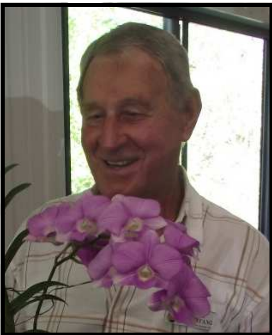
Popular Choice-Den. Burana Pearl 'Stripe' (D&T Walterfang)