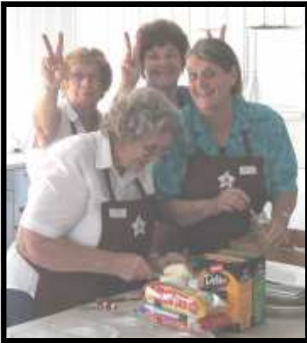
The Workers-Happy lot aren't they?