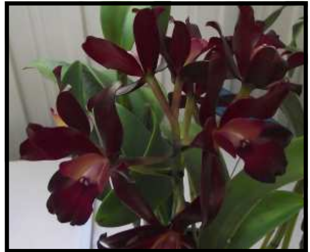
Best Perfume went to C. Netrasiri 'Waxy' (J&B Hopgood)