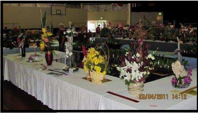
Floral Art Table. The Champion was created by V. Cameron