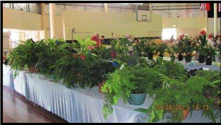
I didn't get an individual photo of the winning foliage entry but it was Vriesea Talbot Green owned by L&S Waite