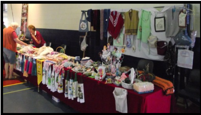
The Craft Table made a big contribu- tion to the proceeds.