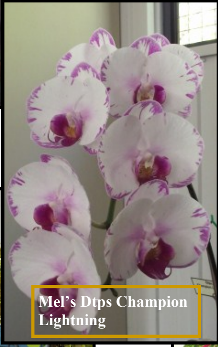
Mel's Dtps Champion Lightning