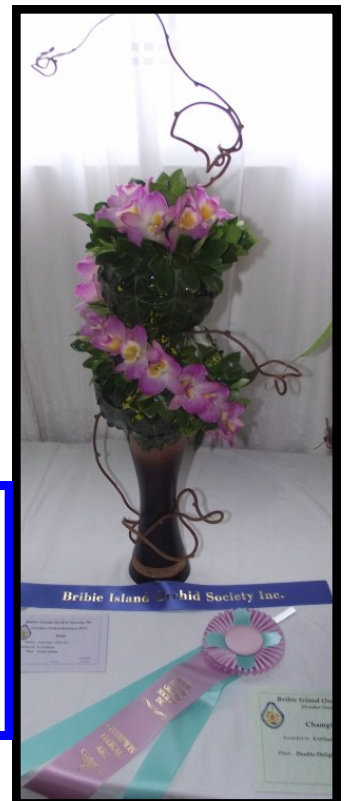
Champion Floral Art E. O'Sullivan Double De- light