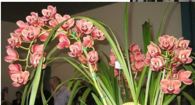
Best Specimen— Cym. Willunga Regal