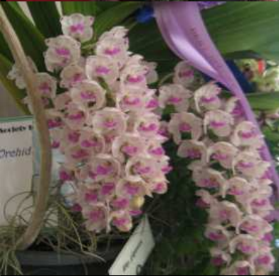
Best Species- Rhy. gigantea