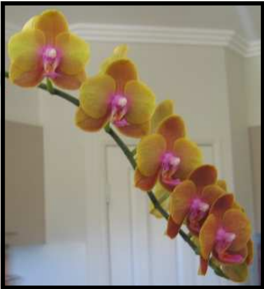
Phal. Tying Shin Miracle