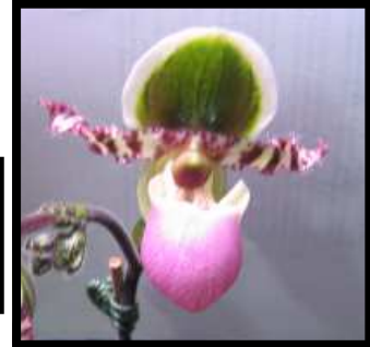
Paph.. Liemianum— Noosa Reserve Cham- pion