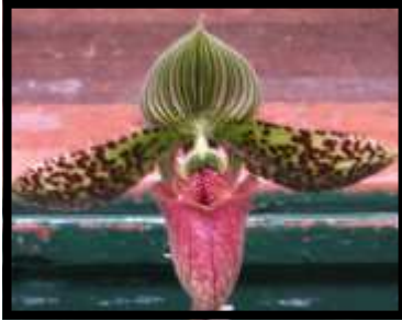
Paph. Sukhakulii— Noosa Champion

Noosa was a benching only show. There were no Bribie plants but our judges who attended found it much easier to judge than the display shows. Paphs took out both Champion and Reserve Champion.