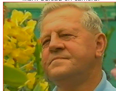
Contentment of a job well done!