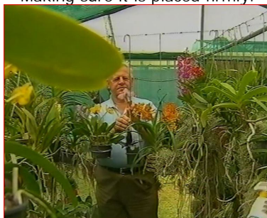
Checking that all is well in the orchid house.