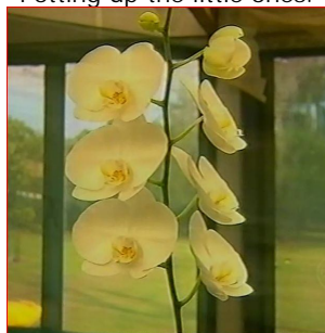
One of Mel's beauties.