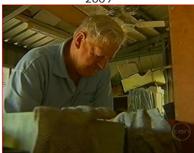
Potting up the little ones.